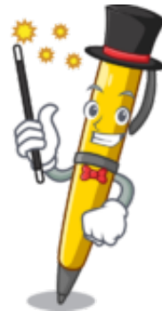
The Secretary's Report