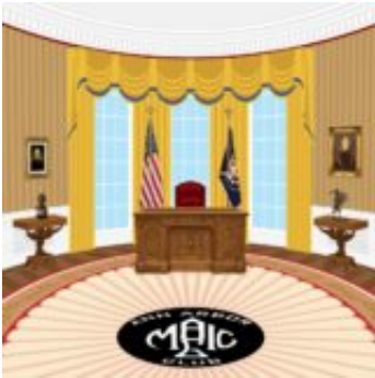
The President's Corner